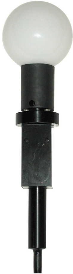
E_0 collector on armored cable

The light shield is fastened onto the spherical collector using the split clamp shown below.